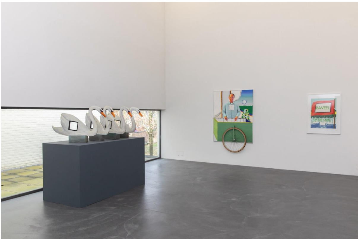
Exhibition view Roger Raveel. The Essence

In honor of the 25th anniversary of the Roger Raveel Museum, the exhibition Scarecrow of the Museum focuses more than ever on the legacy of iconic Belgian artist Roger Raveel. Eleven contemporary artists are invited to engage with Raveel's oeuvre, his life, his museum and his village, each from the perspective of their own interests and practices. Just about all the interventions are new creations that will be nestled in, between and around the exhibition Roger Raveel. The Essence . This overarching exhibition, which already opened its doors on March 23, will thus evolve, transform and be activated by the invited artists throughout the months.